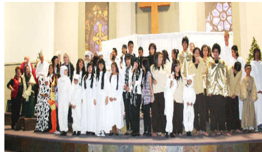
2009 Christmas Program

P.O. Box 378 Modesto, CA 95353 209-549-1828 FAX: 209-521-9192 Healing_Nations@bigvalley.net www.HealingNationsModesto.org