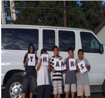
Thanks for Our Van

Please join us for our annual Christmas Production on Tuesday, December 14, 2010, 7:00 pm Wellspring Anglican Church in Modesto